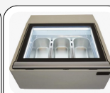
Lights along the whole body frame