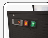
Main switch, light switch and digital thermostat fitted as standard